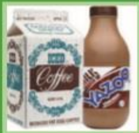
Flavoured milk less than 1Lt